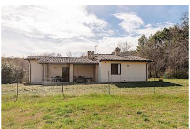
Please check this profile on our website for more pictures. Thank you.