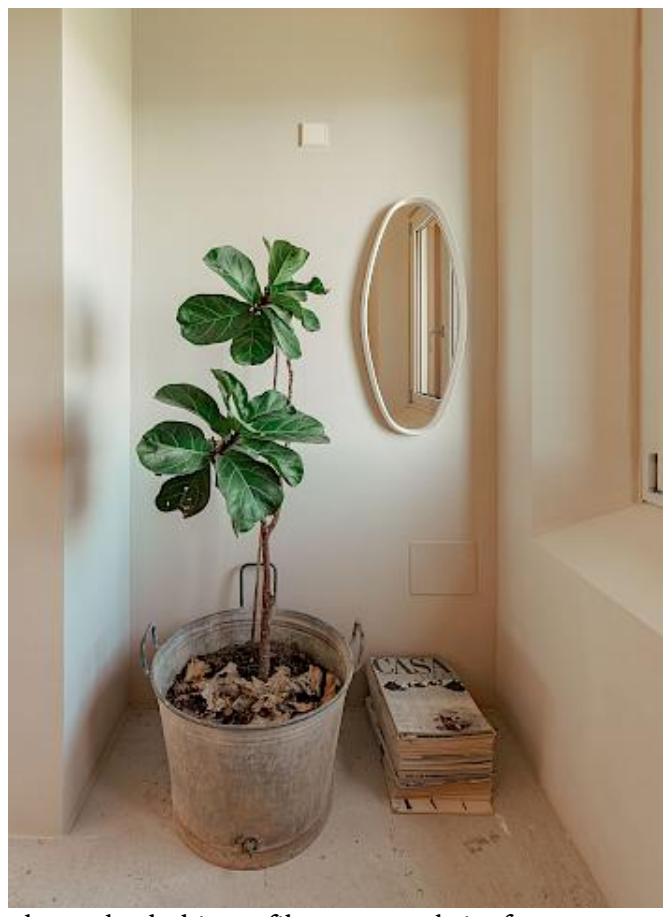
Please check this profile on our website for more pictures. Thank you.