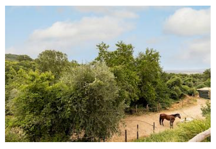
Please check this profile on our website for more pictures. Thank you.