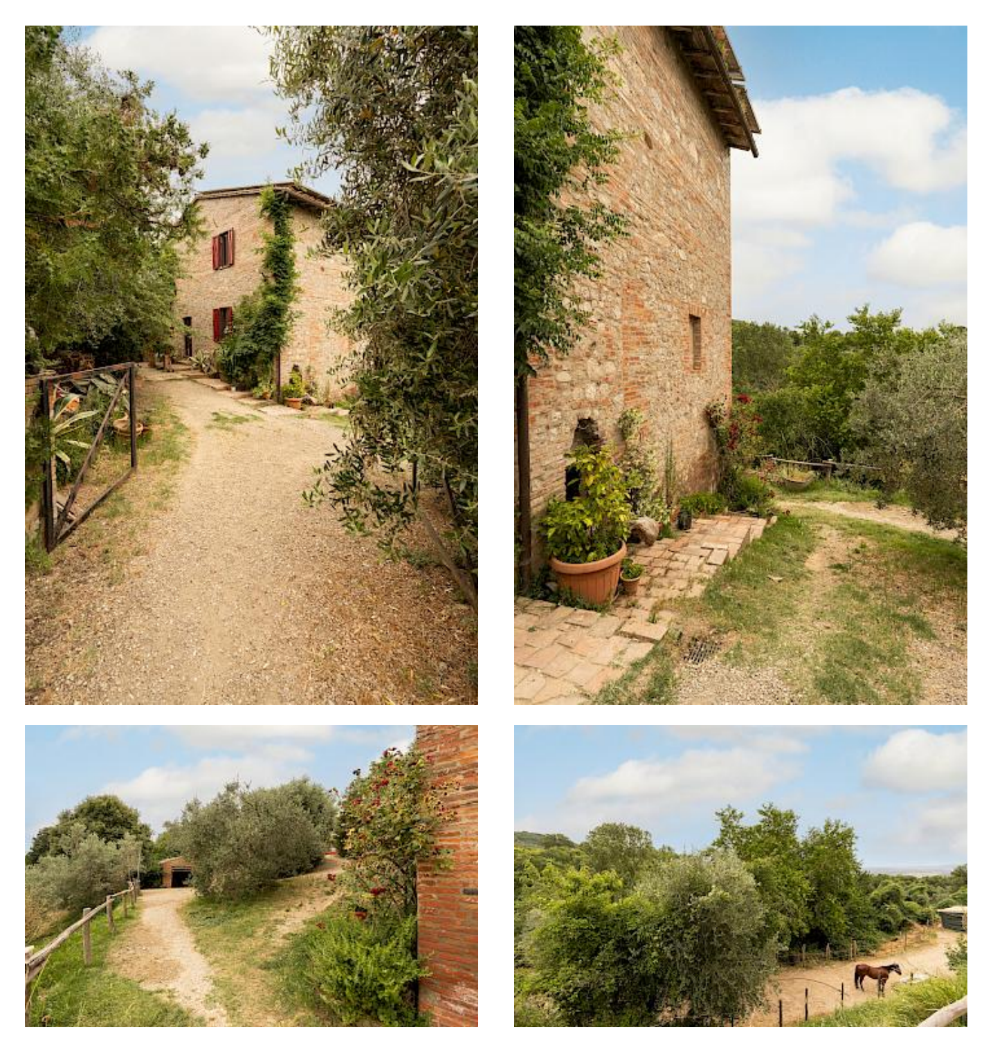
Please check this profile on our website for more pictures. Thank you.