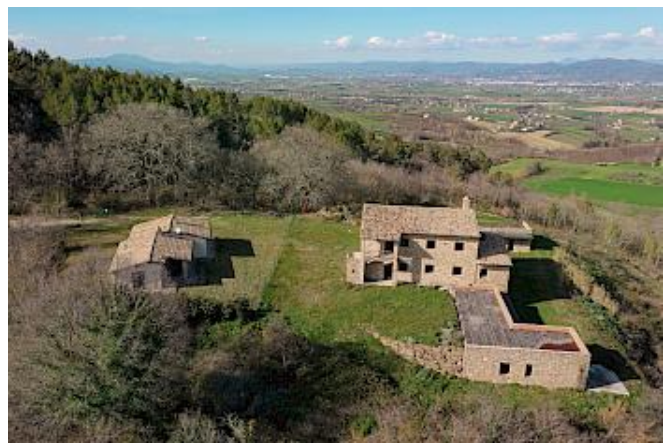
Please check this profile on our website for more pictures. Thank you.