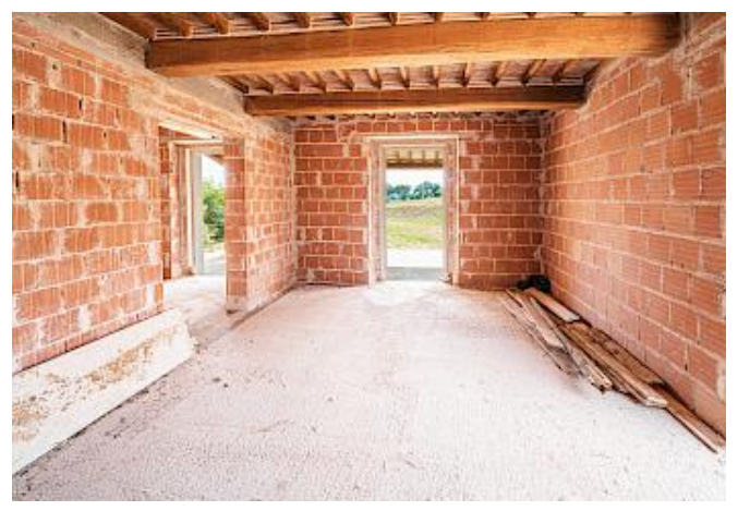
Please check this profile on our website for more pictures. Thank you.