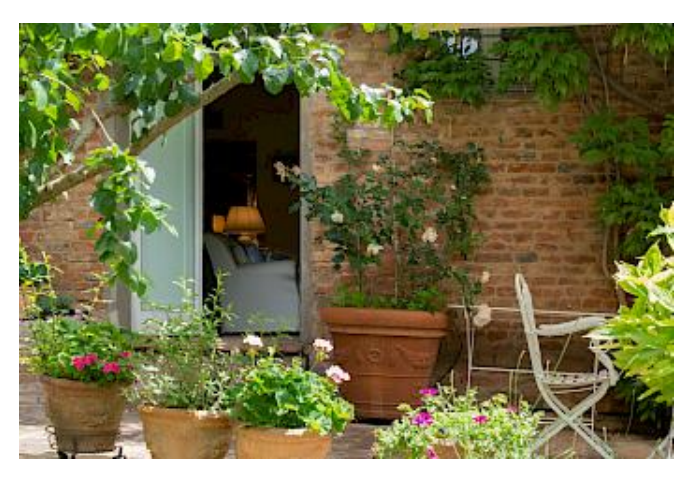
Please check this profile on our website for more pictures. Thank you.