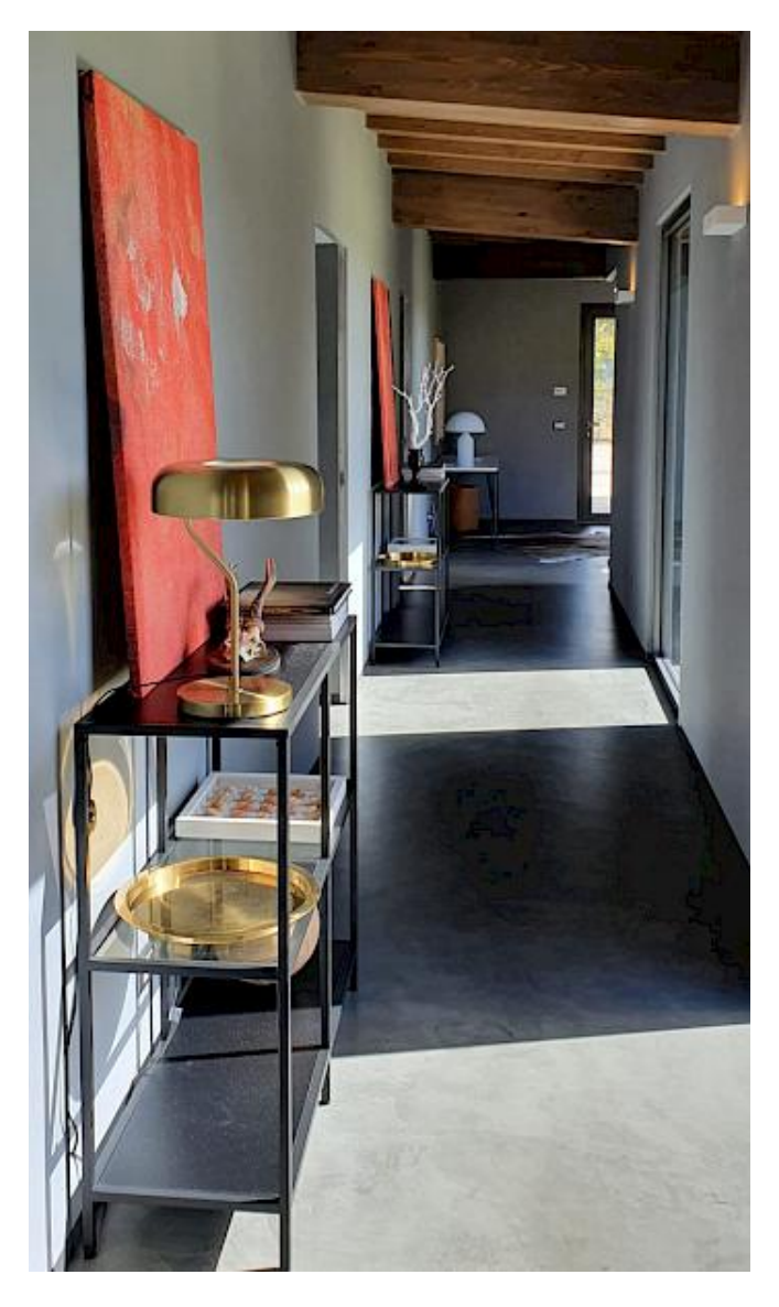
Please check this profile on our website for more pictures. Thank you.