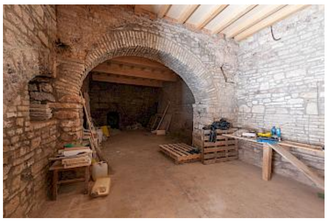
Please check this profile on our website for more pictures. Thank you.