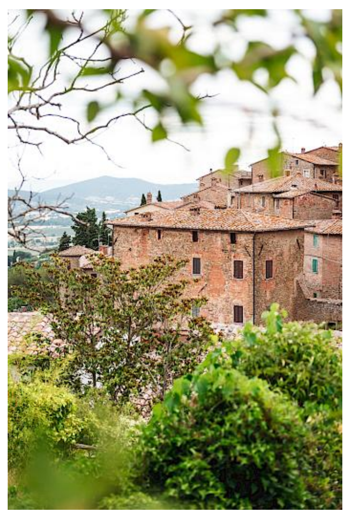
Please check this profile on our website for more pictures. Thank you.