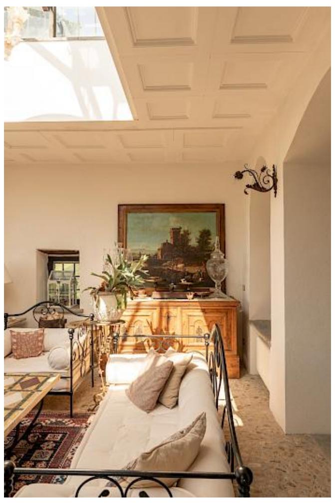
Please check this profile on our website for more pictures. Thank you.