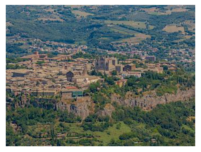
Please check this profile on our website for more pictures. Thank you.