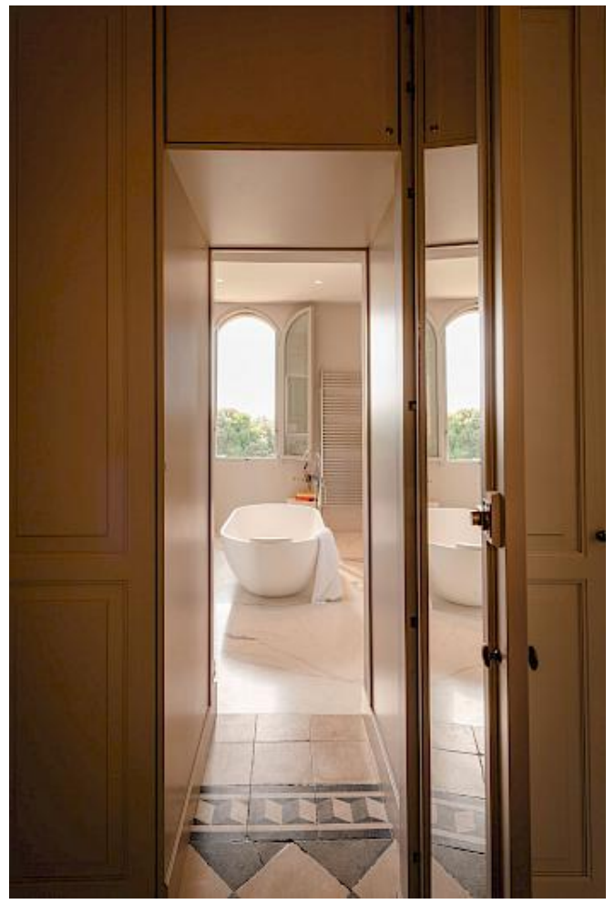
Please check this profile on our website for more pictures. Thank you.